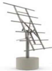
DEGERtracker 3000HD (1)