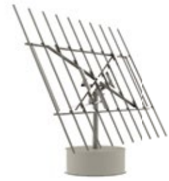
DEGERtracker 5000NT (1)