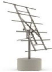
DEGERtracker 3000NT (1)